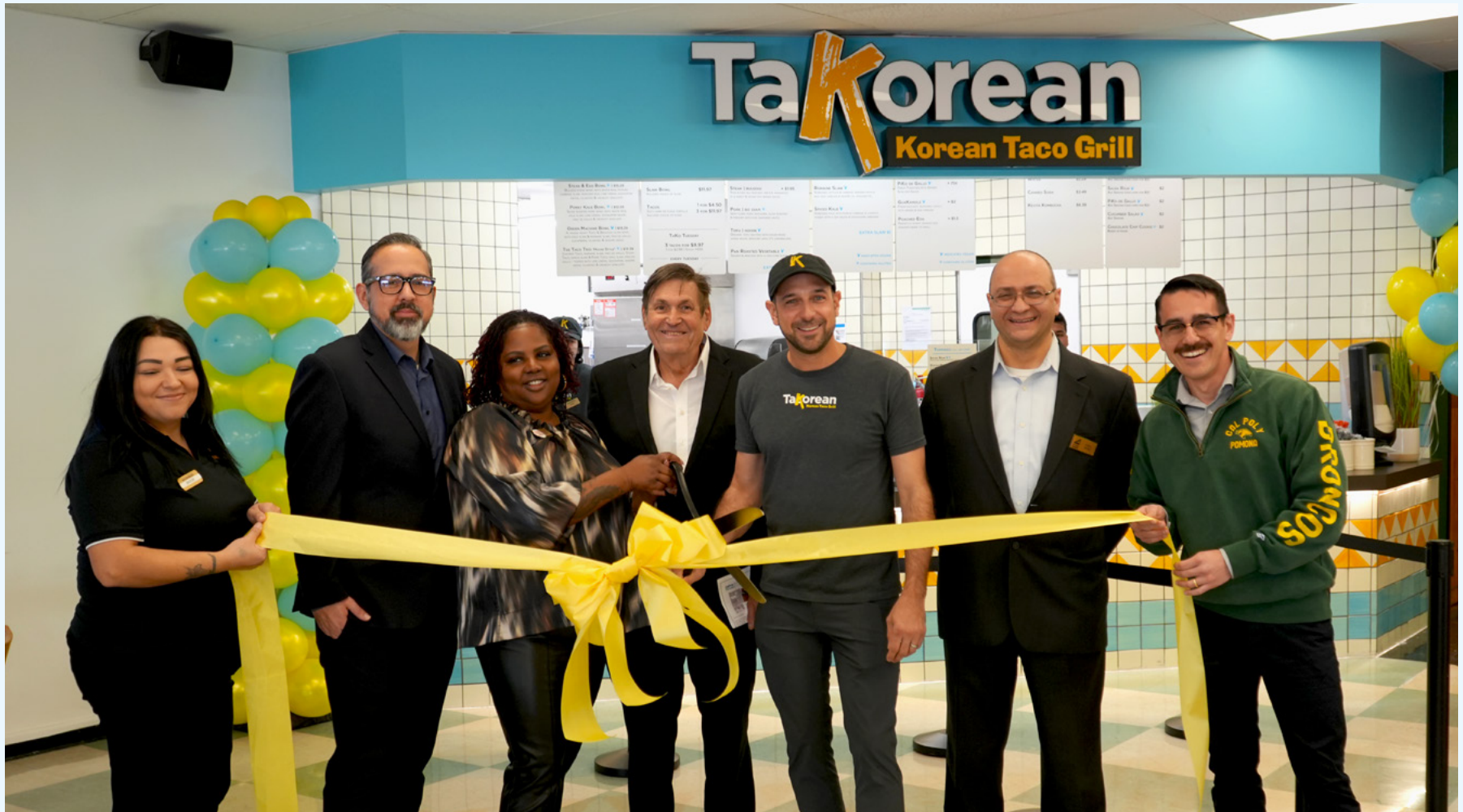
TAKOREAN OPENS FIRST WEST COAST LOCATION AT CPP SEE PG. 4